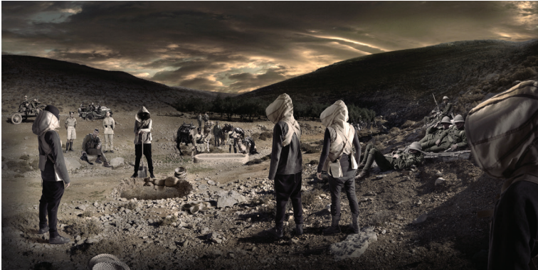
Image 4. Larissa Sansour, In the Future They Ate from the Finest Porcelain , 2015.

ate from porcelain plates? Or is this an image from the future, capturing the discovery of the hidden porcelain plates, following the successful plot of the narrative terrorist? Is it an image of hope in the biblical sense, a time of resurrection? Or is it an apocalyptic image, with biblical Christian references to the shroud of Turin, the plague, and frogs falling from the sky, signaling the end of the world?