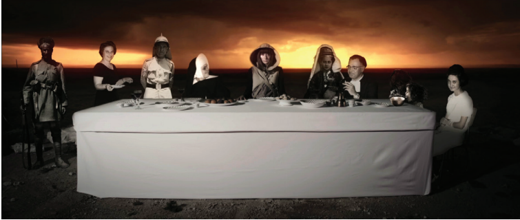
Image 5. Larissa Sansour, In the Future They Ate from the Finest Porcelain , 2015.

Sansour, it is not simply because it allows her to escape the present and visually imagine the future of Palestine. It is because it allows her to highlight the circumstances of the present that make contemplating such a future impossible. Sansour articulates a dystopic utopia through the sci-fi aesthetic and its position vis-à-vis the imaginative and the realistic. With these tools she renders the utopic genre of sci-fi dystopic. The “no place”/“good place” (the double meaning of utopia) 36 in Sansour’s trilogy provides momentary relief followed by a fall ( A Space Exodus ), a simulation of hope that is nothing but a caged dream ( Nation Estate ), or an uncanny return of the repressed, a projection of the past into the future mediated and weighed down by the impact of trauma ( In The Future ).