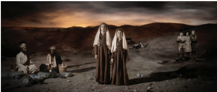
Image 3. Larissa Sansour, In the Future They Ate from the Finest Porcelain , 2015. Courtesy of the artist.

This uncanny effect marks an important moment of connection in the film, when the therapeutic narrative and the visual images enter, for the first time, into a dialogue. The two animated-photograph girls, it becomes clear, are the narrator and her dead sister. The living and the dead, holding hands in the middle of the frame, are surrounded by images that draw attention to their own composition and artificiality. Images of overtly orientalist biblical figures are staged against images of modern-looking figures such as soldiers or statesmen, with the vast and empty desert between them. 29