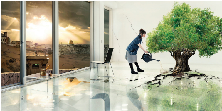
Image 2. Larissa Sansour, Nation Estate , 2012. Courtesy of the artist.

designed with the black and white pattern of a Palestinian headscarf (keffiyeh), she gazes at the miniature olive tree. As in Sansour's earlier films, here too the Palestinian cultural icons, such as the olive tree, keffiyeh, and the Dome of the Rock, appear in abundance. They are conspicuously staged as "visual icons." Thus these cultural and national symbols are acknowledged as significant, perseverant elements. At the same time, they are rendered obsolete. 20 Indeed, the hyper-stylization of these symbols in Nation Estate makes them appear particularly plastic, as if they belong in a wax museum or a kitschy souvenir store. The overt clash between the recognizably Scandinavian, clean-line design of the estate and the specific Palestinian national symbols that make for the "stuff" of the estate makes it hard to determine: Are these symbols or clichés?